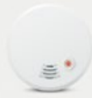
2 Smoke alarm Detects smoke and fire