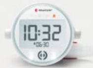
6 Alarm clock Uses sound, light & vibrations