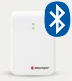
4 Telephone transmitter Monitors the phones