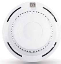
Smoke alarm transmitter