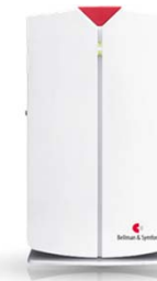
Baby cry transmitter