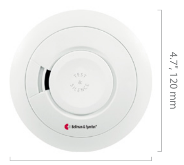
4.7", 120 mm