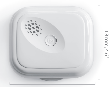
140 mm, 5.5"